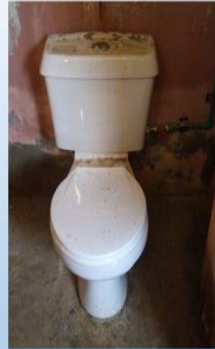
Sitting toilet for outpatients