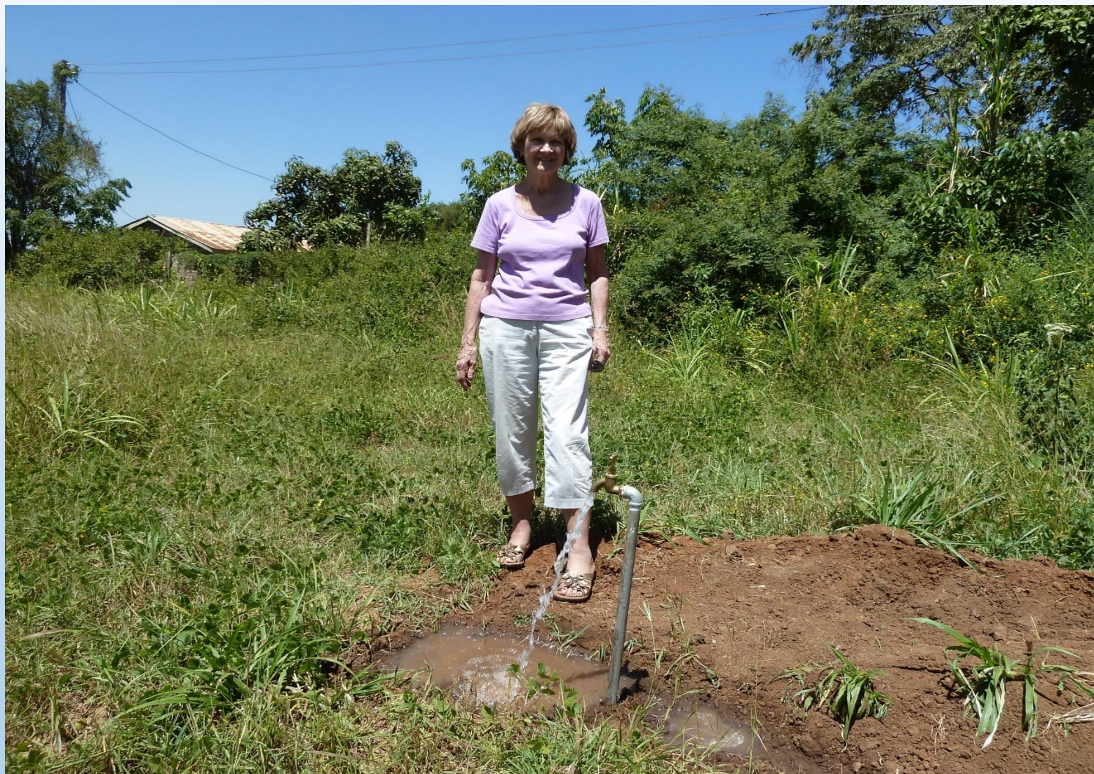
Faucet at farming area