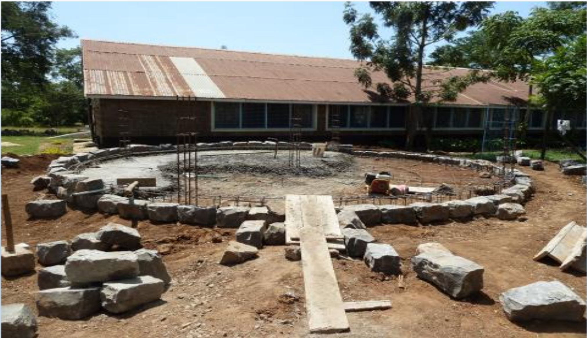
Storage tank on Jan 8, 2015