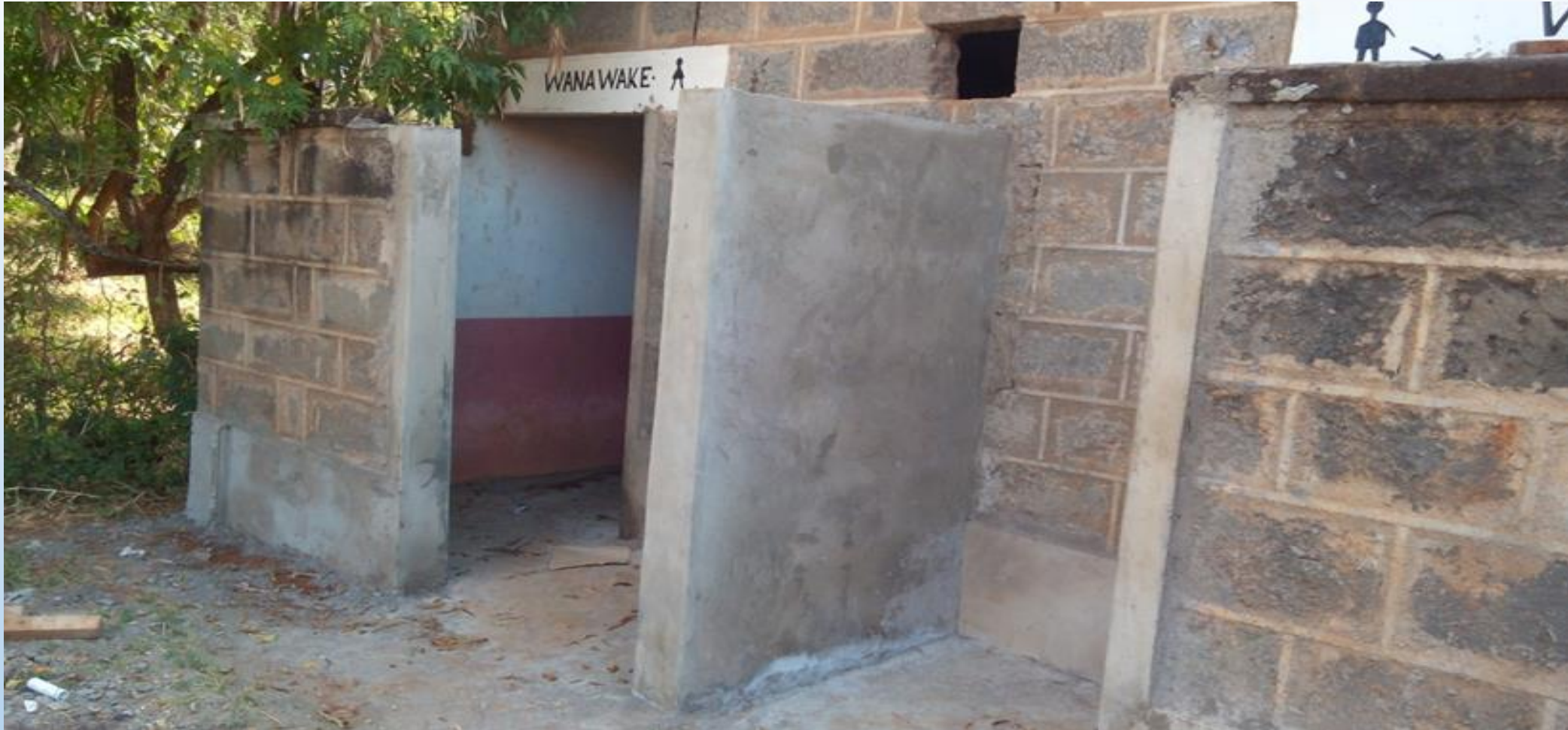
Out Patient Toilets Wall built to separate male/female toilets