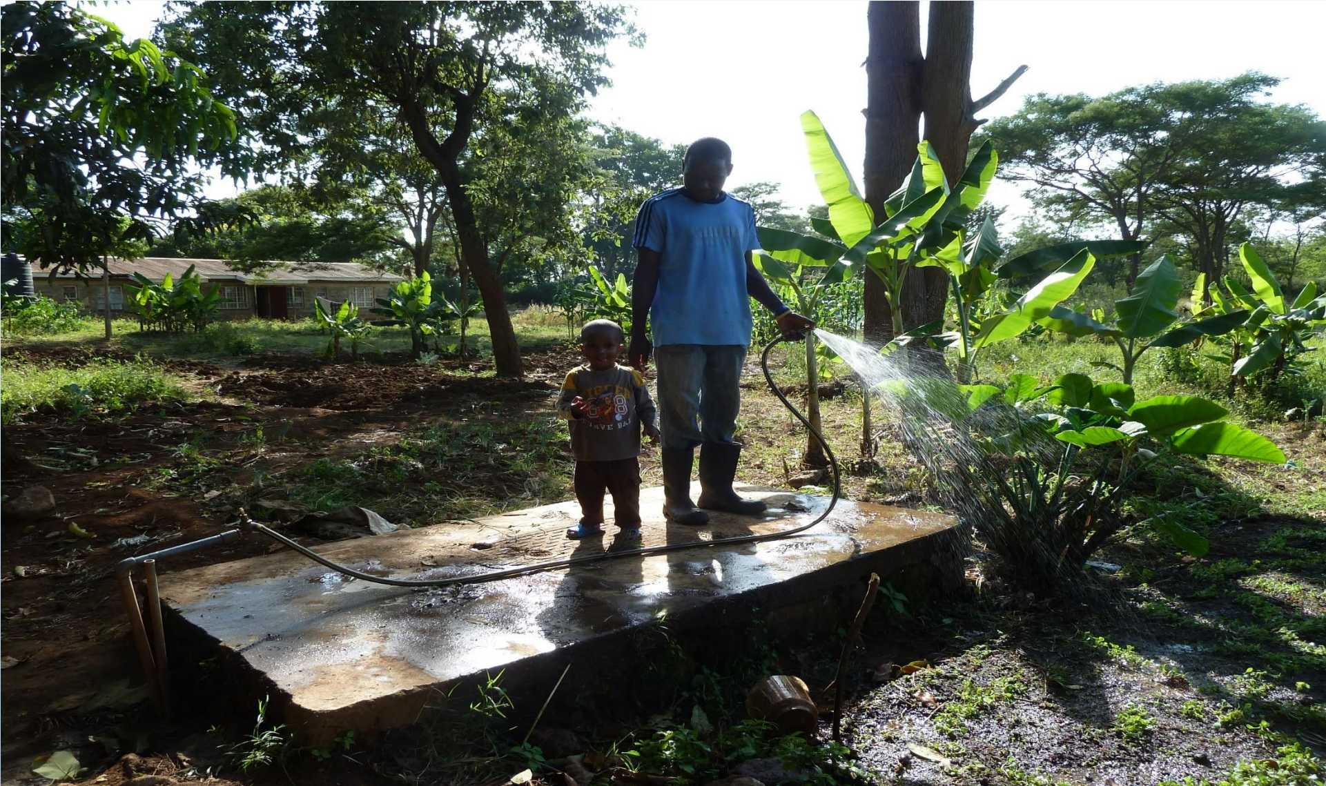
Water for irrigation