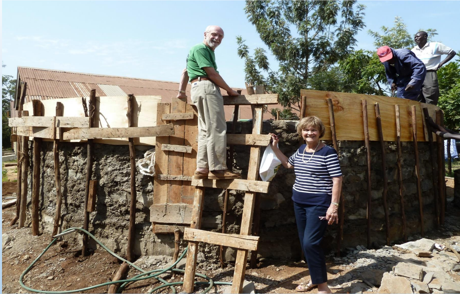
Rainwater storage tank under construction