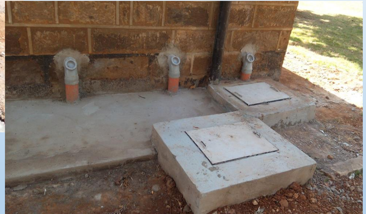
Septic area during/after construction